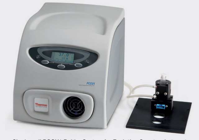
Single-cell PCCU1 Peltier System for Evolution Spectrophotometers