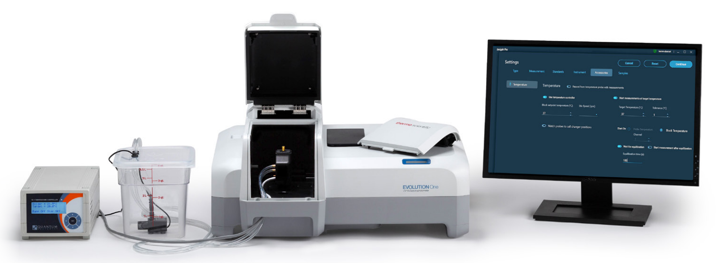
Single-cell Peltier System with water reservoir for Evolution Spectrophotometers

Re-circulating water or coolant provides an effective heat sink to allow the Peltier element to heat or cool the block over a wide temperature range. The single-cell holder can reach as low as 0 °C and as high at 110 °C. The 8-cell holder can be cooled to 5 °C and heated to 100 °C. Unlike thermostatting with a traditional re-circulating bath where a large volume of liquid must be heated or cooled, heating or cooling the cell holder with the Peltier effect means more rapid and more precise temperature control.