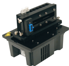
8-cell Peltier Accessory

Use the external controller to specify temperature to a precision of 0.1 °C in the single-cell or 8-cell water-cooled Peltier Accessories in the Evolution Series Spectrophotometer. The single-cell holder can cool to 0 °C and heat up to 110 °C. The 8-cell holder can be cooled to 5 °C and heated to 100 °C.