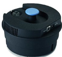
SPG-1A Air-cooled Peltier System for GENESYS 140-180 and BioMate 160

Compared to traditional large-volume recirculator systems that rely on 4 L or more of water/anti-freeze mixture, Peltier Thermostating Systems eliminate or substantially reduce both routine maintenance and flood impact in the event of a hose failure. Thermo Scientific liquid-cooled systems use a small volume of recirculating liquid (water or coolant) that requires only occasional topping up and different stop-gap measures to shut the system off in the event of failure (such as with hoses or water levels).