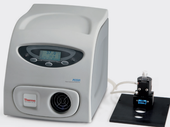
Single-cell PCCU1 Peltier System for Evolution Spectrophotometers