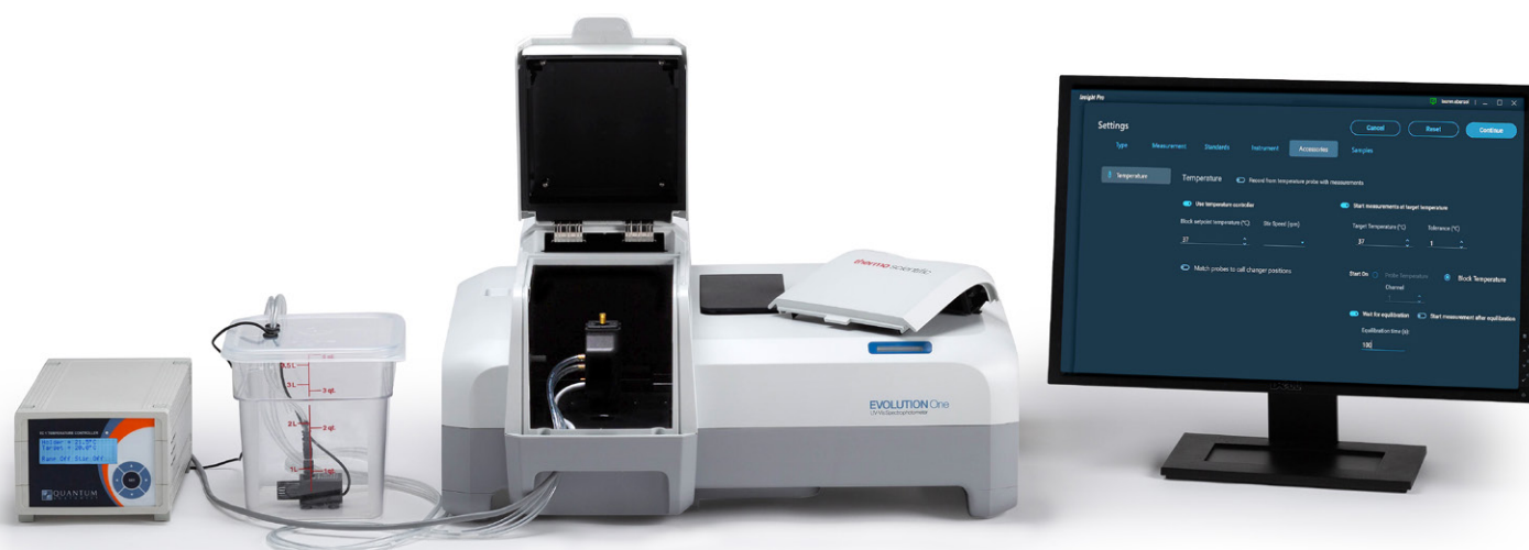
Single-cell Peltier System with water reservoir for Evolution Spectrophotometers

Re-circulating water or coolant provides an effective heat sink to allow the Peltier element to heat or cool the block over a wide temperature range. The single-cell holder can reach as low as 0 °C and as high at 110 °C. The 8-cell holder can be cooled to 5 °C and heated to 100 °C. Unlike thermostating with a traditional re-circulating bath where a large volume of liquid must be heated or cooled, heating or cooling the cell holder with the Peltier effect means more rapid and more precise temperature control.